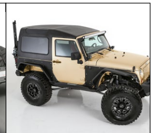
JK 2 Door Safari Hard Top