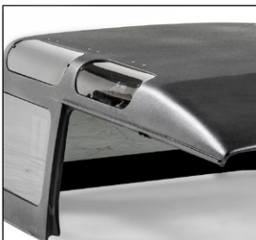
Overhead portal windows increase ambient lighting

No vehicle on the market projects the same sense of adventure as the Jeep® Wrangler. You can now make your '07+ Jeep® Wrangler even more useful with Smittybilt's new Safari Hard Top. This 1 piece made top puts the "fun" in functional with unique overland look.