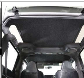
Increased interior space