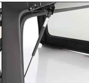
Hydraulic Lift Struts