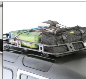
Optional Smittybilt Defender Rack available.