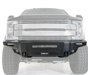
Shown with winch cradle removed and 21" light bar internally mounted for a sleek, stylish look.

Smittybilt's genre-busting new M1A2 Heavy Duty Modular Truck Bumper gives you the best of both worlds by letting you transform your truck from winched up workhorse to city slicker via a removable winch cradle and LED light bars with multiple mounting options. Matching rear bumper and side steps also available.