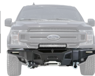
Shown with winch installed and 21" light bar mounted using included brackets.