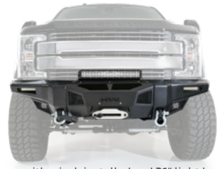
Shown with winch installed and 21" light bar mounted using included brackets.