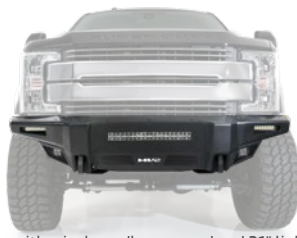
Shown with winch cradle removed and 21" light bar internally mounted for a sleek, stylish look.

Smittybilt's genre-busting new M1A2 Heavy Duty Modular Truck Bumper gives you the best of both worlds by letting you transform your truck from winched up workhorse to city slicker via a removable winch cradle and LED light bars with multiple mounting options. Matching rear bumper and side steps also available.