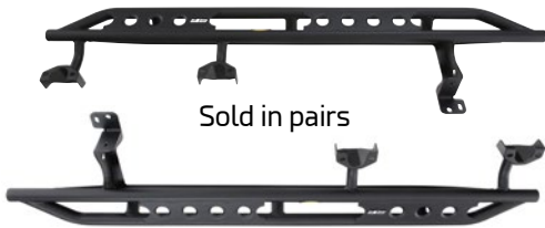
Sold in pairs